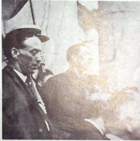
1917 On his first election to Dail Eireann, he was unanimously chosen President of Sinn Fein and of the Irish Volunteers.