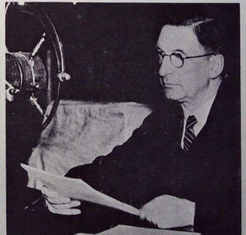
1945 Broadcasting his historic reply to the attack of the British Prime Minister on Ireland's war-time neutrality.