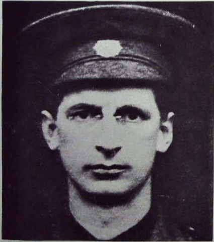
1916 In the Irish Volunteer uniform in which he fought throughout the Rising of Easter Week.