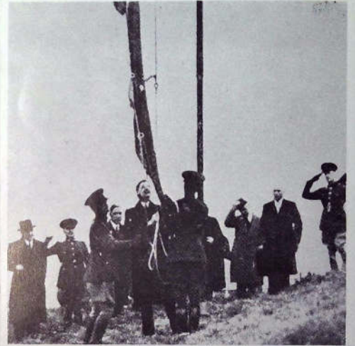
1938 A great moment—the taking over of the Ports. Mr. De Valera hoists the Tri-colour at Spike Island, Cork Harbour.