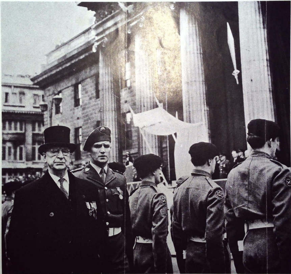
As President of Ireland, Eamon De Valera reviews the guard of honour during the historic 1916 Golden Jubilee celebrations in Dublin a few weeks ago. Ireland and the world watched the impressive ceremonies, and heard the Proclamation read again from the steps of the G.P.O.