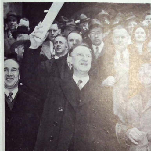
1949 In New York, on one of his many journeys abroad to promote Ireland's claim for re-union of the national territory.