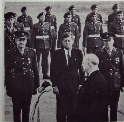
1963 Greeting the late President Kennedy at the start of his momentous visit to Ireland.