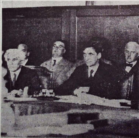
1932 As President of the Council of the League of Nations, he made Ireland's voice heard in the cause of international peace.